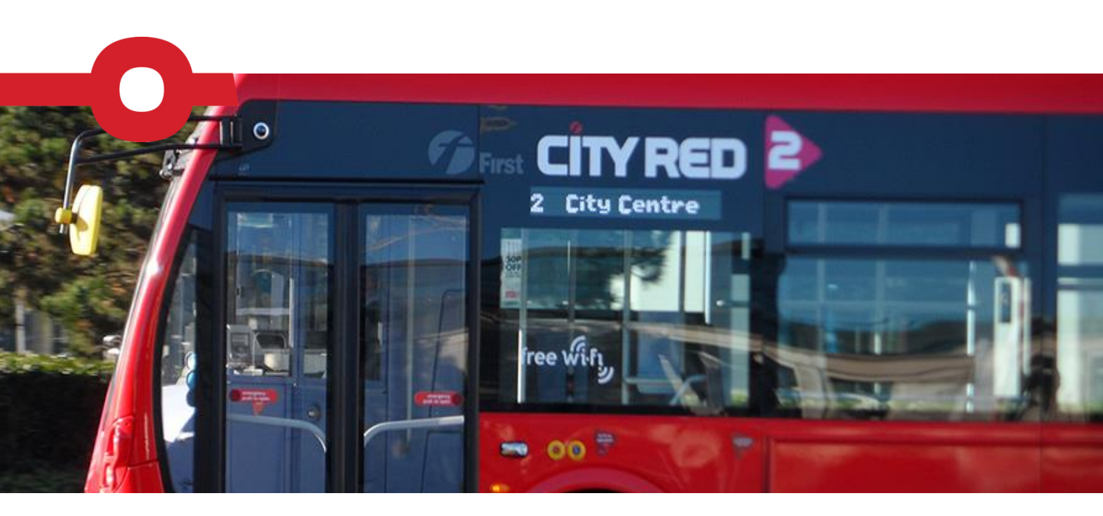
Phase 1: Literature Review